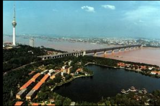
Yangtze River Bridge