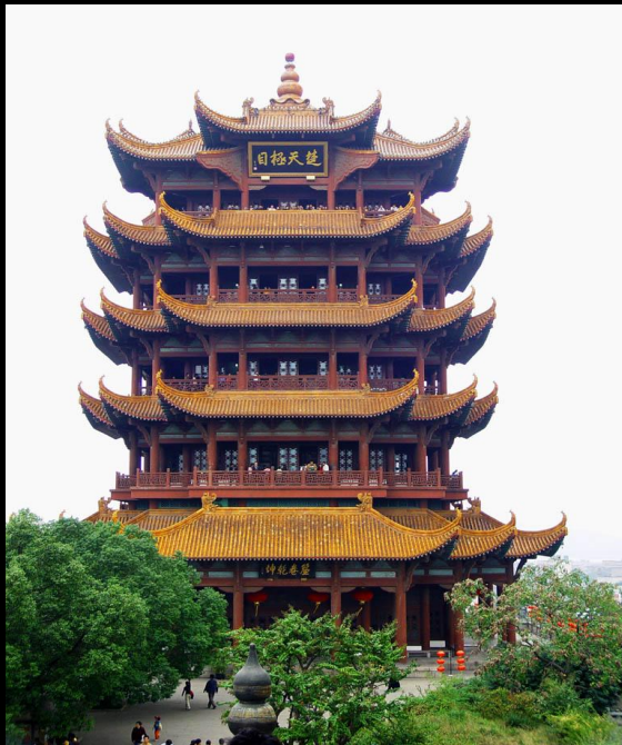
Yellow Crane Tower