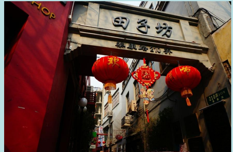
Tian Zi Fang