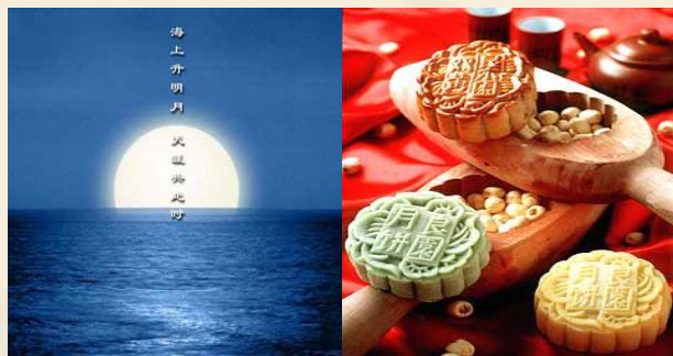
Mid-Autumn Festival 中秋节