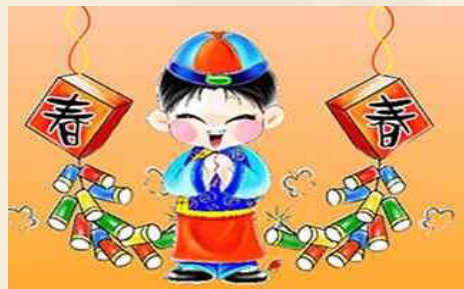
Chinese Spring Festival 春节