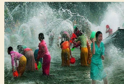
The Water Festival 泼水节