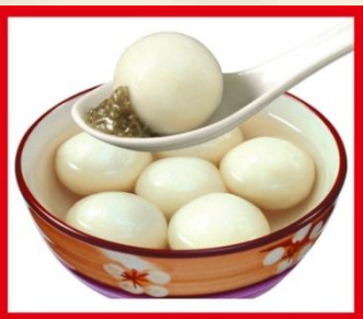
The Lantern Festival 元宵节