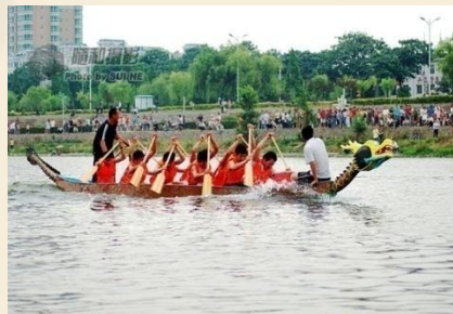
The Dragon Boat Festival 端午节